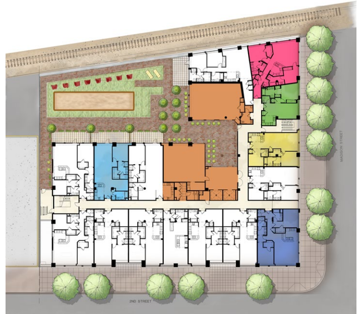
Typical Residential Level