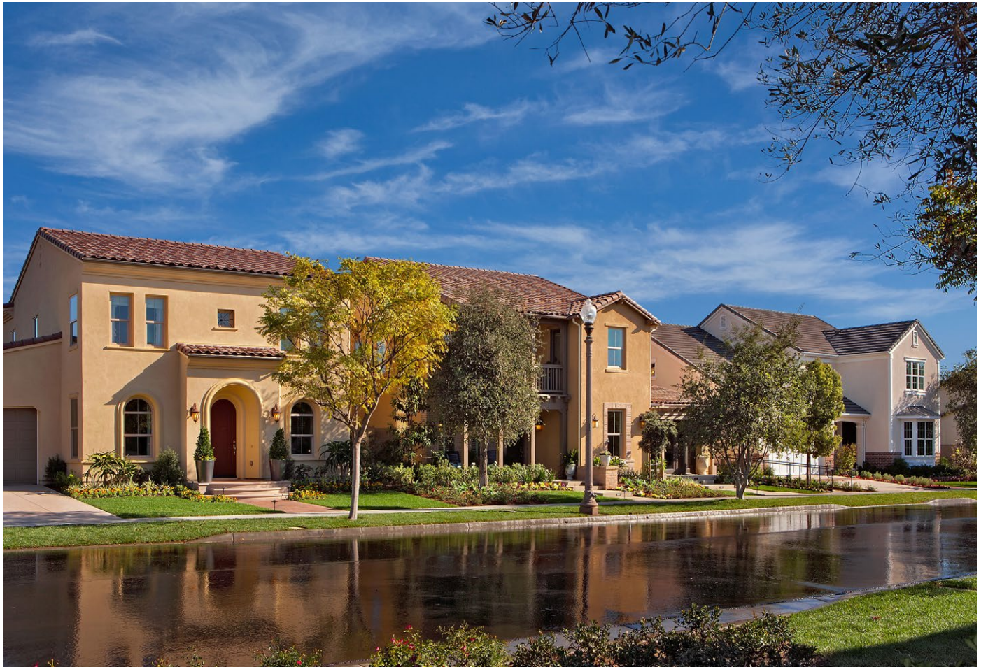
20130007 - Photography © Eric Figge