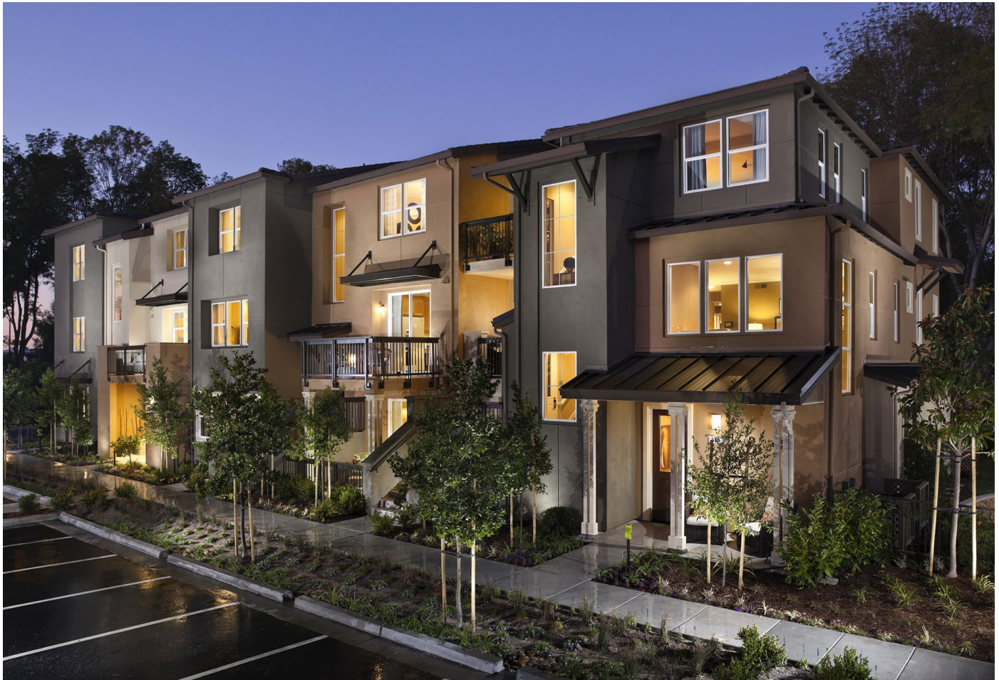
20090241 - Photography © Christopher Mayer