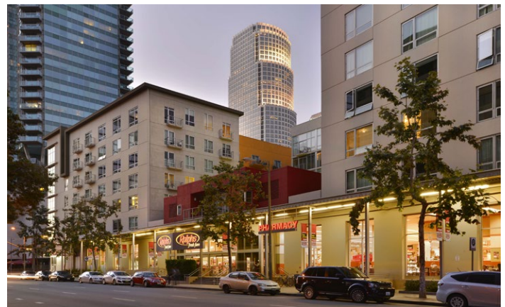
20050120