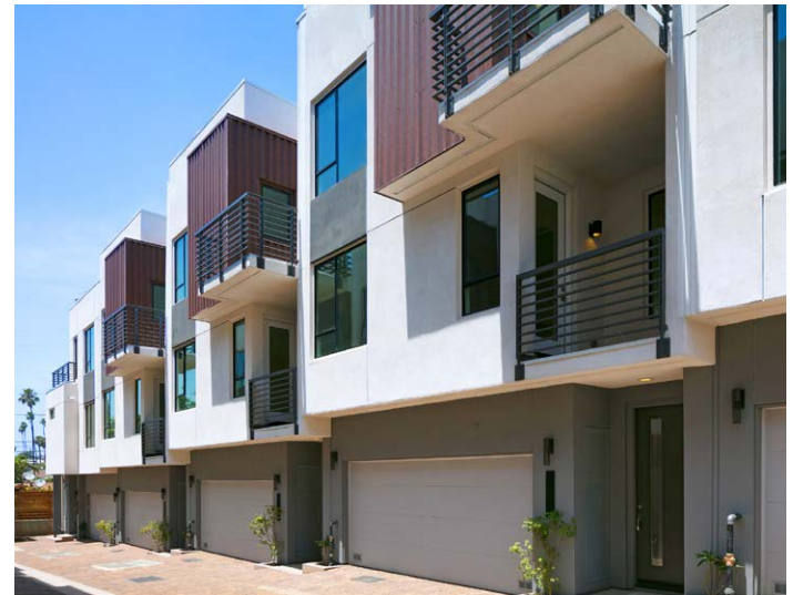
20130804 - Photography © Chang Kyun Kim