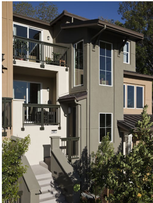
20090241 - Photography © Christopher Mayer

Targeting mixed-income buyers, Fusion seamlessly integrates 36 new contemporary buildings with 3 existing Spanish eclectic buildings, which were built by a former builder. There are 228 townhomes (flat, carriage-style and traditional) with 7 different floor plans with 2-4 bedrooms, attached spacious 2-car garages. A newly renovated community recreation center, "PULSE," includes a Wi-Fi lounge, coffee bar, flat screen TV, fireplace, catering kitchen, 12-seat theater (which can be reserved for private functions) and a premium fitness center. There is also a meditation garden and putting green for residents to enjoy. Fusion is GreenPoint Rated (121 points) which validates its sustainable design elements.