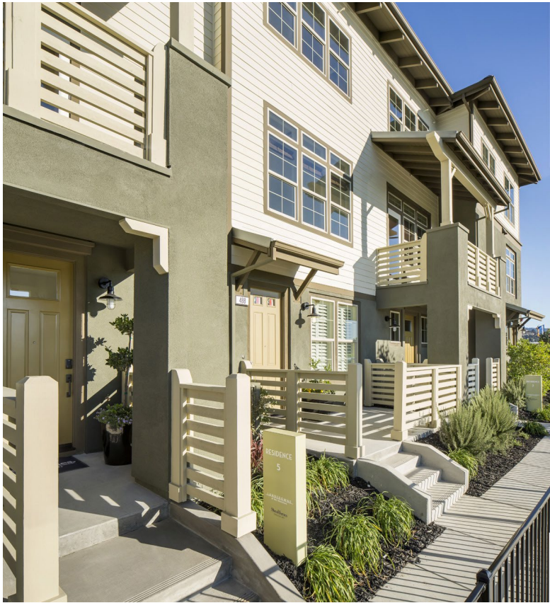
Landsdowne at Bay Meadows