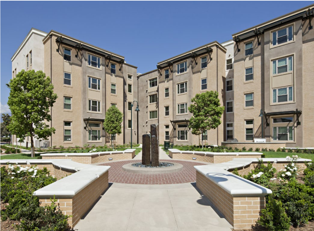
20100379 - Photography © Henniker Photography