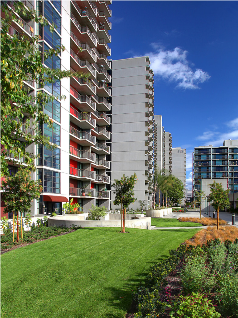
20070572 - Photography © Applied Photography & Proehl Studios