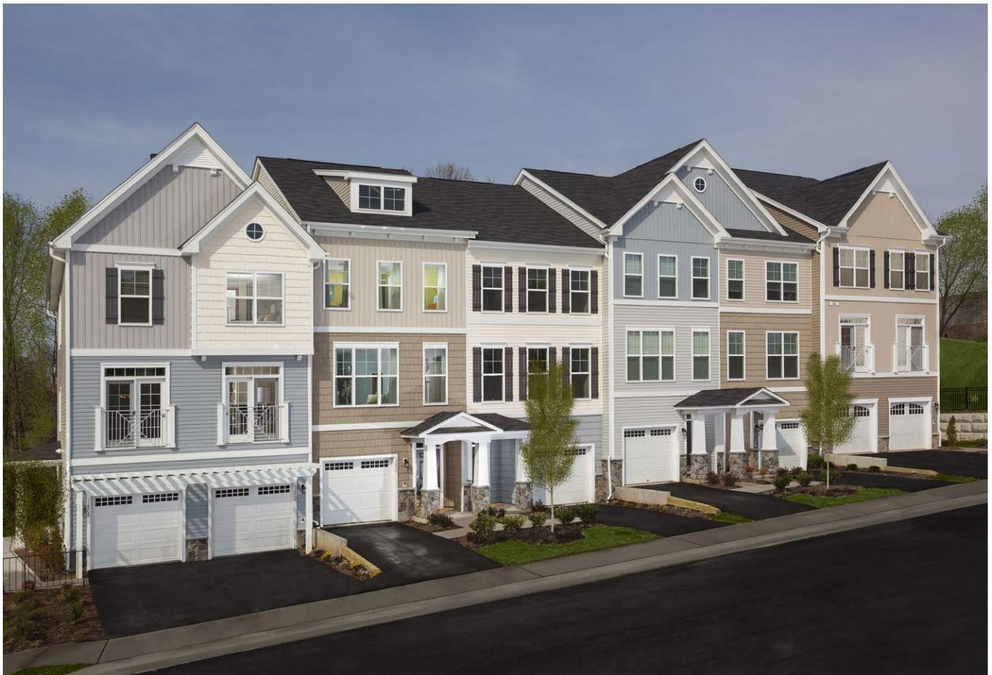
20100279 - Photography © Applied Photography